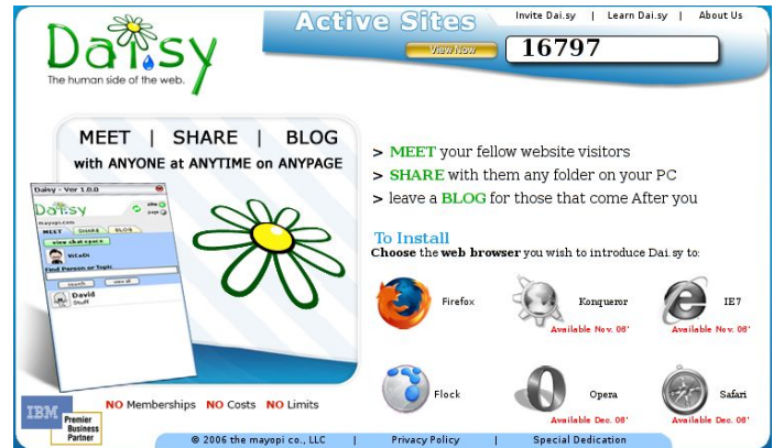
Fig. 2: Dai.sy uses the sidebar in compatible web browsers

Dai.sy – “The human side of the Web” is a sidebar for Firefox and Flock browsers. (Internet Explorer 7, Konqueror and Opera will follow in the next month or so.) With it you can make any website a meeting place (Meet), exchange files on a peer-to-peer basis (Share) and leave comments for those that visit the site later (Blog).