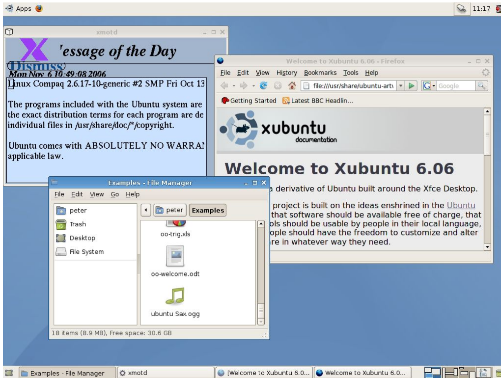
Fig. 5: Xubuntu uses the Xfce desktop - fast, but different