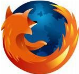
Fig. 1: Firefox's trademark logo is the subject of some dispute in Linux circles

In less than two years, tens of millions of people worldwide have discovered the easier, faster and safer online experience that Firefox provides. Translated into more than 35 languages at its release, Firefox 2 is available in a native language version for more people around the world than any other Web browser.