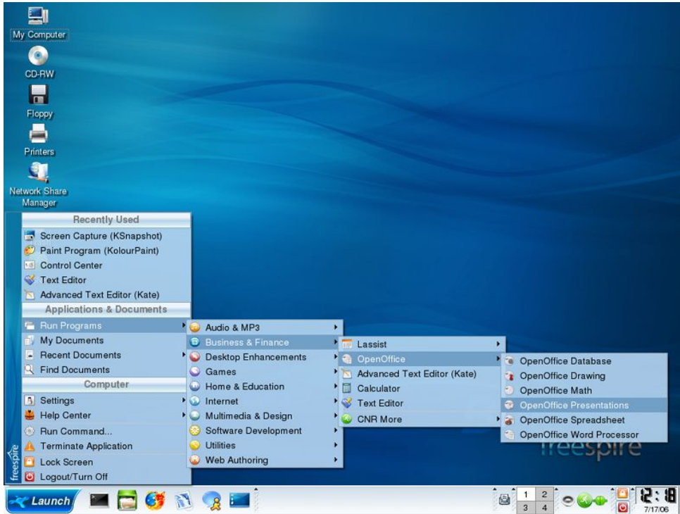
Fig. 4: Freespire - Linspire-sponsored, but free

Freespire can be downloaded from various sites by FTP, HTTP or